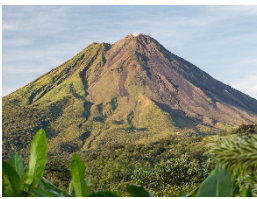
Overnight Arenal Volcano

Your shared shuttle will meet you at the hotel reception to head to the beautiful Arenal Volcano around the scenic Lake Arenal. After checking into the hotel, you will head to the volcanic hot springs for a relaxing soak in the naturally volcanic heated waters at the base of the Volcano to relax followed by a local dinner. - NOTE: Transfers between Beach and Arenal and Tours have Shared Transportation