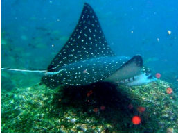
Overnight Beach Hotel

Scuba divers begin their diving on Day 2. Enjoy 2-Tank (Local) Dives where you will have a great variety and abundance of marine life. Return to the hotel for afternoon by the pool or ask us to arrange an adventure tour.