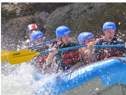
Overnight Arenal Volcano

Head out on an epic rainforest adventure. Choose between 2 great options of how you want to experience Costa Rica. Lunch included on all tours.