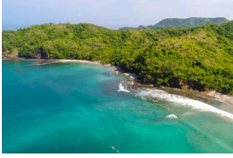
Overnight Beach Hotel

Welcome to Costa Rica! Touch down at the Liberia International Airport (LIR). You will be met by one of our representatives as you exit the airport and then make your way to the Pacific Coast. Spend the next 7 days enjoying the lovely tropical beaches, grand adventures, the wonders of Costa Rica. Check into your hotel, grab a tropical drink and enjoy the sunset before your next morning dive adventure. You will have a dive briefing in the evening with your dive center to check in and confirm any last-minute questions about diving conditions.